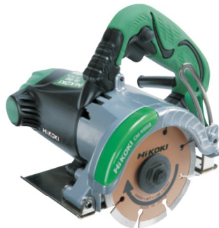
CM4SB2 with an optional diamond wheel