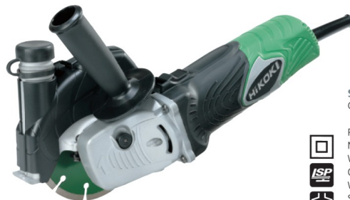
CM5SB with an optional diamond wheel